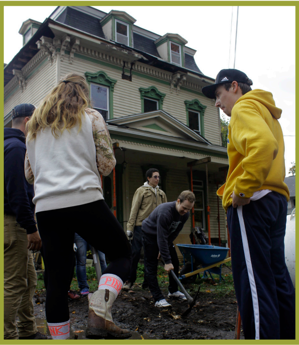
Student volunteers helping to restore the new house on West Riddle Avenue in Ravenna.