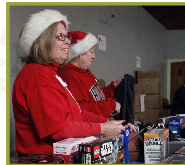
2016 holiday volunteers wait for children at their toy station.

Thanksgiving boxes will be distributed on November 15 and 16. Christmas boxes will be distributed on December 13 and 14. Drop off toys, groceries and other donations at: